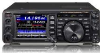
Provided by BVARC and Houston Amateur Radio Supply

All mode, all band MF/HF/VHF/UHF transceiver with C4FM (System Fusion) Digital capability