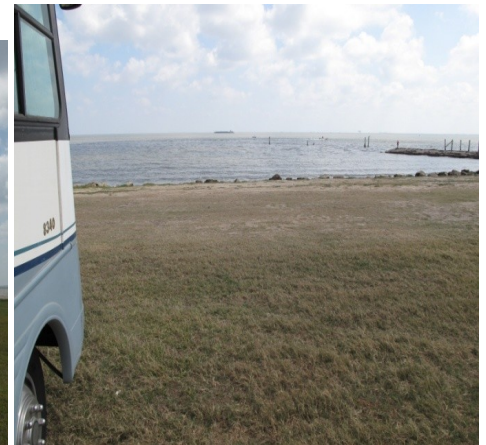
View from station site (from top left) south, east west and north.