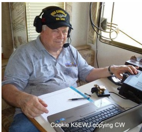
Cookie K5EWJ copying CW