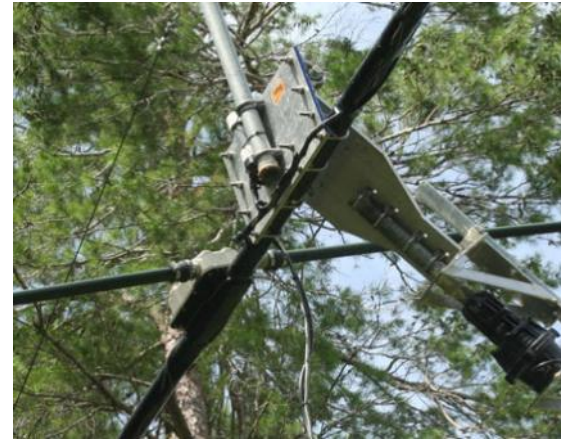
Tilt Plate by NN4ZZ 73 de W5PF

ways further information and directions to the dinner and meeting are on our web site www.tdxs.net .