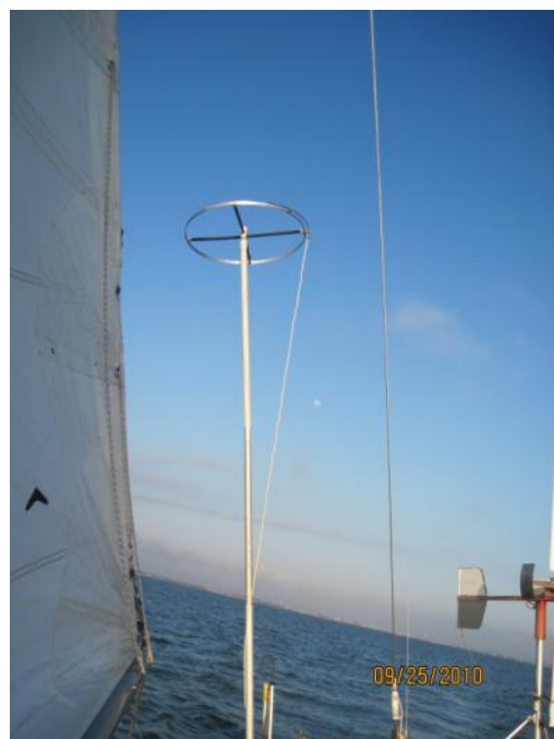
Solitaires 6m Halo