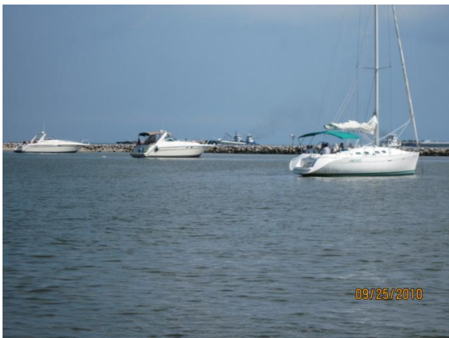
Redfish Island Anchorage