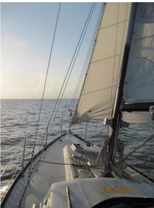
Headed to Redfish Island

As you can imagine, the down side of having a floating ham shack can be considerable. A contest ends up being like a mini-dxpedition. For example, in planning for the TQP I did the usual things like making sure my logging software worked with the radio. Then I made sure I had diesel, water, propane, and food. I checked the weather, the tides, the batteries, the GPS, the autopilot, etc. Finally, the night before, I packed my bag, kissed the XYL and kids, and got some sleep. The up side of having a floating ham shack fortunately includes things like enjoying a sunrise and a cup of coffee alone on Galveston Bay during the two hour trek to Redfish Island.