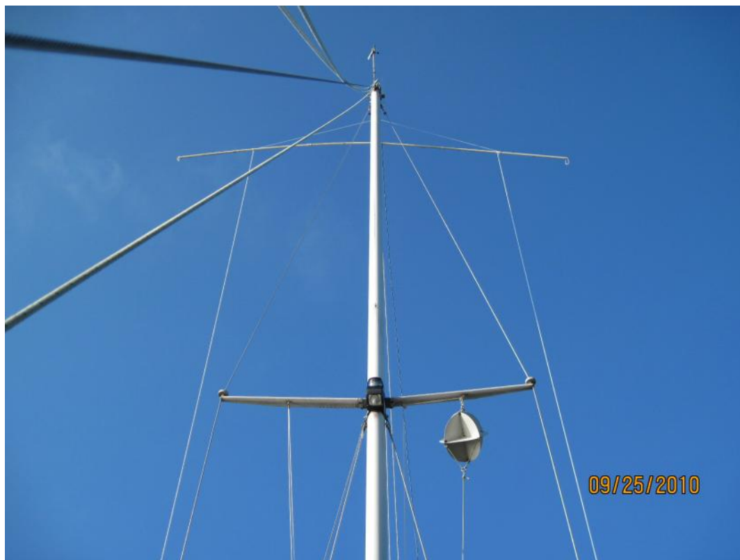
10m Dipole Atop the Mast

All told I talked to about 140 folks two times each for both counties. I submitted a claimed score of 39,944. Gosh I miss 15-meters. See you on the air, or in the water. 73's KD5TIO.