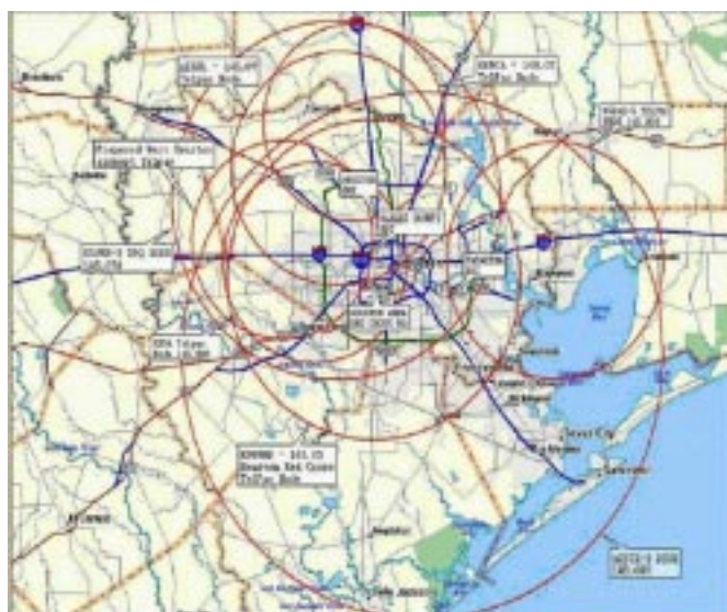
WinLink 2000 in Harris County